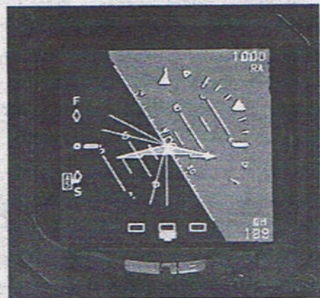
Figure 1. Left bank with clutter.